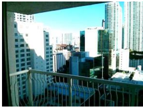
THE CLUB AT BRICKELL BAY unit# 1922. BRICKELL