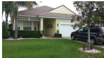
MAGNOLIA. PORT SAINT LUCIE