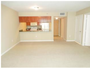
THE CLUB AT BRICKELL BAY unit# 3812. BRICKELL