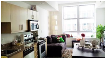
FLAGLER FIRST unit# 702. DOWNTOWN MIAMI