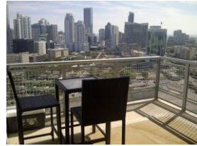
WIND unit# 3004. DOWNTOWN/BRICKELL