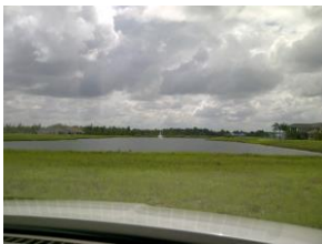
BAY HILL ESTATES lot# 36 (1 acre). WEST PALM BEACH