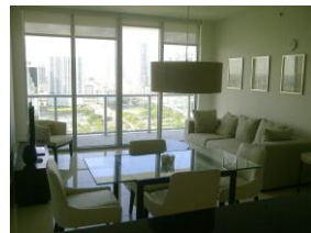
AXIS unit# 3024-N. BRICKELL