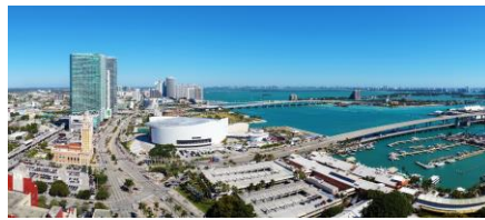
VIZCAYNE unit# 3504-N. DOWNTOWN MIAMI