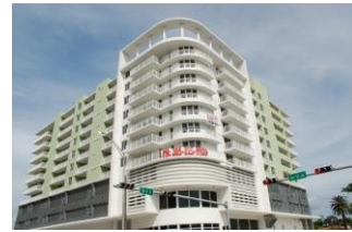
SAN LORENZO unit#901