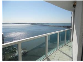
SKYLINE unit# 2005. BRICKELL