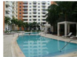
VENTURE unit# 308-west. AVENTURA