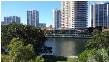
OCEANVIEW unit# 317. AVENTURA