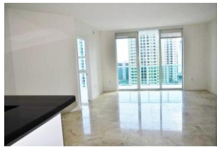
SOLARIS unit# 2002. BRICKELL