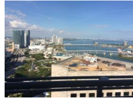
ONE MIAMI penthouse# 4400-East. DTWN/BRICKELL