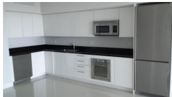
MINT unit# 2509. DOWNTOWN MIAMI