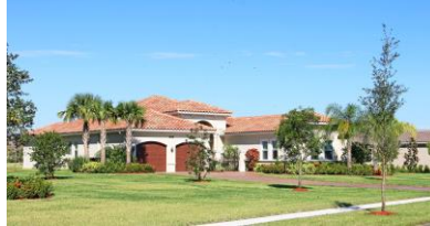
THE PRESERVE at BAY HILL ESTATES. WEST PALM BEACH