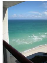
STERLING unit# 2008. MIAMI BEACH