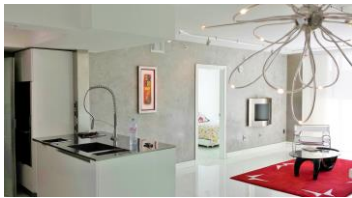
CITE penthouse# 617. EDGEWATER