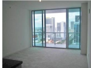
AXIS unit# 1403-S. BRICKELL