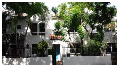
PROVENCE VILLAGE #8. COCONUT GROVE