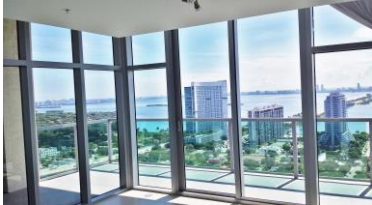
MIDTOWN 4 lower penthouse# H-3015. MIDTOWN MIAMI