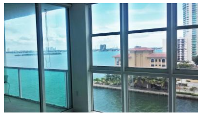
MOON BAY unit# 907. EDGEWATER