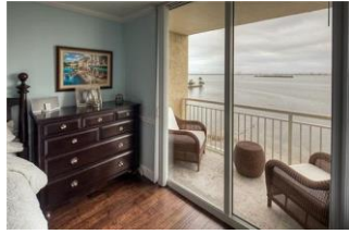
CITE unit# 520. EDGEWATER