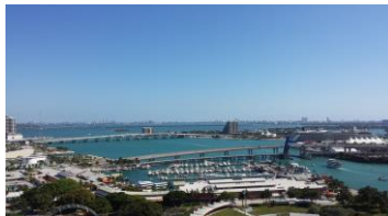
50 BISCAYNE unit# 2301. DOWNTOWN MIAMI