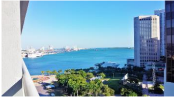
50 BISCAYNE unit# 2411. DOWNTOWN MIAMI