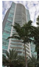
SKYLINE unit# 902. BRICKELL