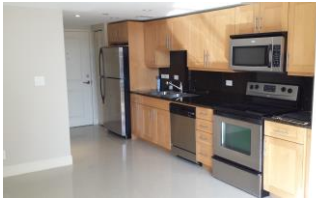
FLAGLER FIRST unit# 804. DOWNTOWN MIAMI