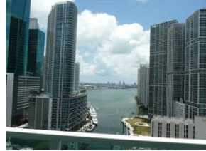
BRICKELL ON THE RIVER unit# 2508-N. BRICKELL