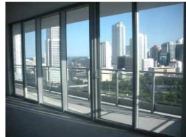
MINT unit# 3104. DOWNTOWN/BRICKELL