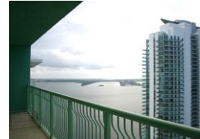
THE CLUB AT BRICKELL BAY penthouse# 4305. BRICKELL